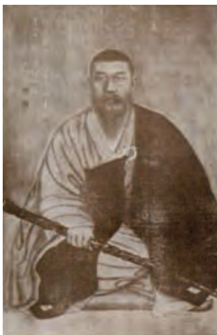
Above right: Cover of Collected Writings of Gyeongheo (XXVI)