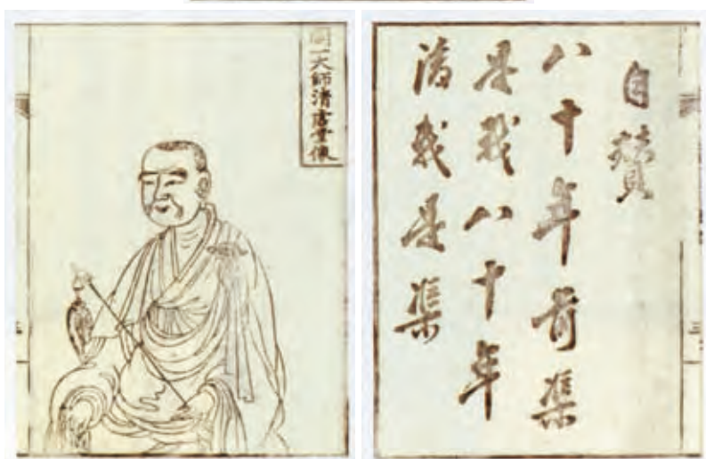
Above: Title page of Poems of Cheongheodang (X) by Hyujeong (1520–1604)