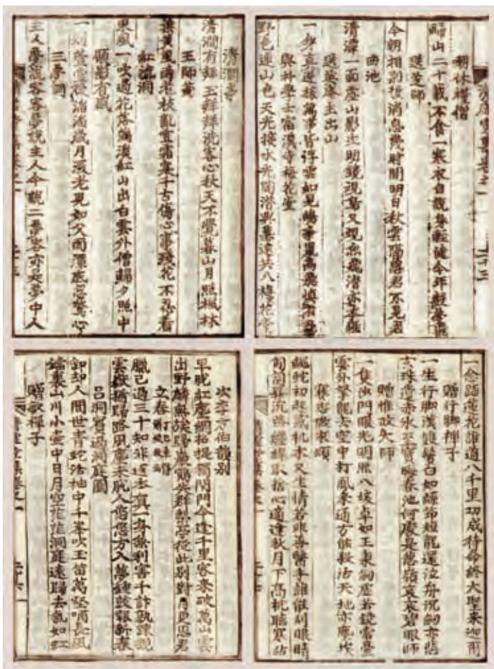
Four pages of Poems of Cheongheodang (X) by Hyujeong, 1520–1604. The first poem on the lower left page, A Reply to Magistrate Ri's Farewell Verse, is translated on pp[266–7]